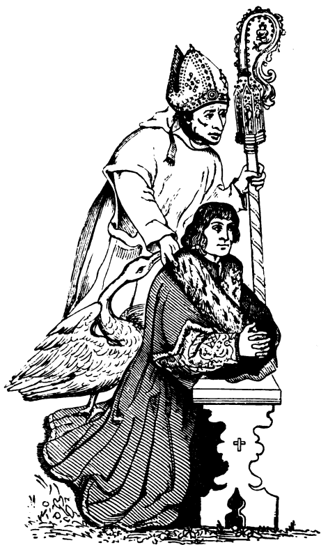
S. Hugh presenting a votary ( from a picture in the Boisseree Gallery ).